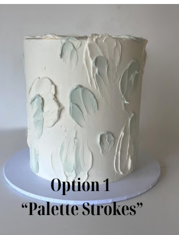
Option 1 "Palette Strokes"