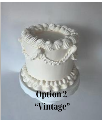
Option 2 "Vintage"