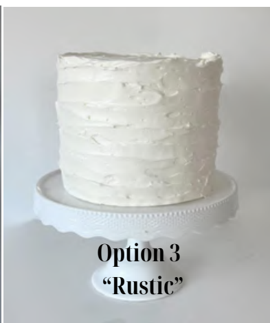
Option 3 "Rustic"